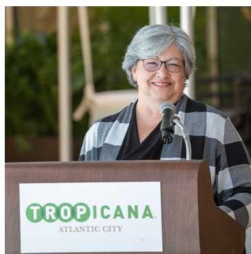
NJDOT Commissioner Diane Gutierrez-Scaccetti addresses ACECNJ members.