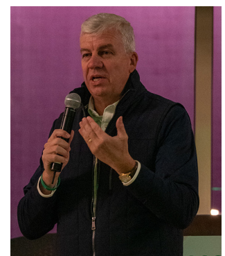
NJ Turnpike Authority Executive Director addresses the ACECNJ Fall Conference attendees.