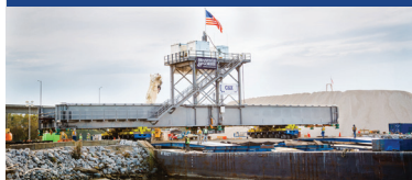
HDR, Inc. Bayou Sara Swing Bridge