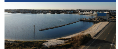
T&M Associates Iowa Court & South Green Living Shoreline Project