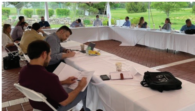
ACECNJ Emerging Leaders class hard at work!